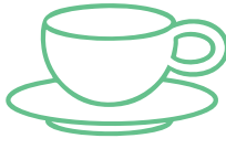
Free Tea & Coffee