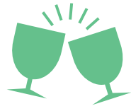
Socials & Wellbeing