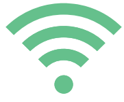
Super Fast Broadband